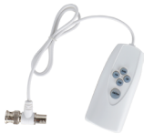
PFM820 UTC Controller